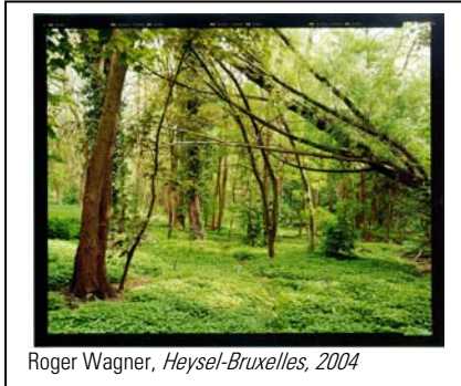
Roger Wagner, Heysel-Bruxelles , 2004

Notions of landscape and representation also lie at the heart of Roger Wagner's work. At first sight, the work suggests a natural environment that is "remote" and untouched, but the caption and its title Heysel-Bruxelles just as soon refer the shooting location to a contemporary urban space. Underlying notions of the sublime and the picturesque which surface for a brief instant are deceptive; the possibility of an Eden brought into tension by the unexpected coming together of the natural world and the urban, by re-localisation and context. By way of its large format and