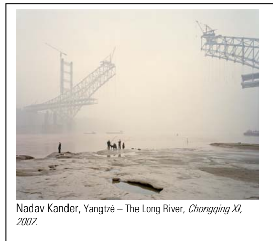
Nadav Kander, Yangtze – The Long River, Chongqing XI , 2007.

By way of a photographic approach which lays deliberate claim to slowness, in opposition to the accelerated pace of his time, Nadav Kander recounts the mutations of an environment and its agglomeration, from the perspective of China's longest river, the Yangtze. The atmosphere of silence and uniform tonality, the wide shot, the studied composition, lend these landscapes a surreal quality – the protagonists seem to be moving detachedly through a vast space, like figures in a super-sized mock-up. In the moment of shooting, time seems to be suspended in a simultaneous presence of past and future, between tradition and progress. The lack of anchorage is palpable, the euphoric growth of a new era progressing at a dizzying pace against a backdrop of almost biblical proportions. A drone of anxiety seems to pervade these images like a kind of background noise: we waver between their intriguing beauty, the threat of an unbalanced ecological reality and the gradual evaporation of memory.